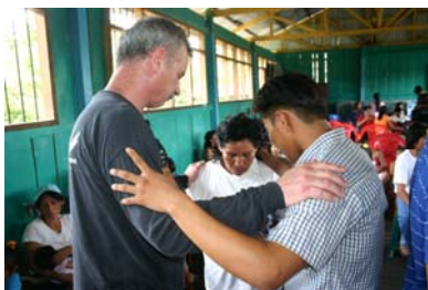
Howard Hughes prays for a man who just received a new pair of eyeglasses.