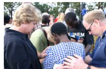
Ministry team praying for healing.

Available online at www.eternityminded.org/emmstore.htm Cost: $10.95