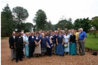
Twenty-nine volunteers ministered with us in Gitega.