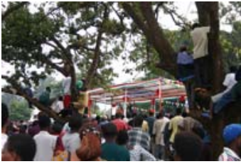
People climbed trees to get a closer look and listen to the message.