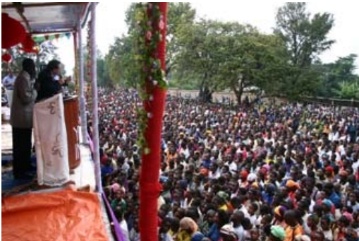
Multitudes came to hear the message. Over 5,000 made a decision for Jesus. Praise the Lord for our new brothers and sisters in Christ.