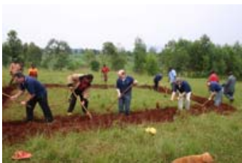
Ground is broken on the new school site in Gitega. Construction is scheduled to be completed before this fall.

“The Lord is transforming this land of genocide by replacing hatred and killing with spiritual healing and education. Praise His Holy Name!”